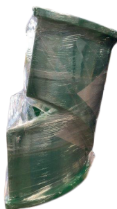
Stacking of nose cones with shrink-wrapping