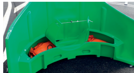
Open hatches (2 m model)