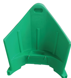
Closed hatch (1 m model)