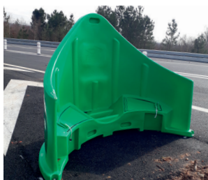
Closed hatches (2 m model)